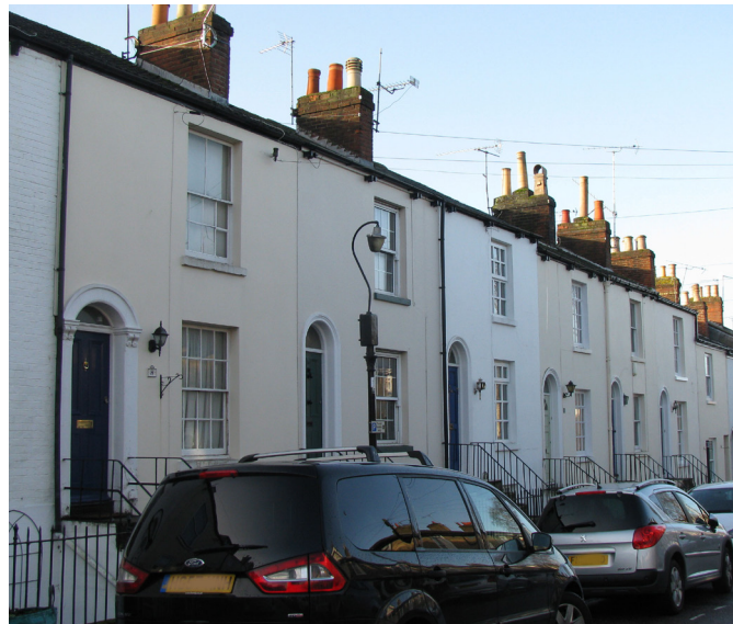
Fig 14 Amoy Street public car park Fig 15. Canton Street