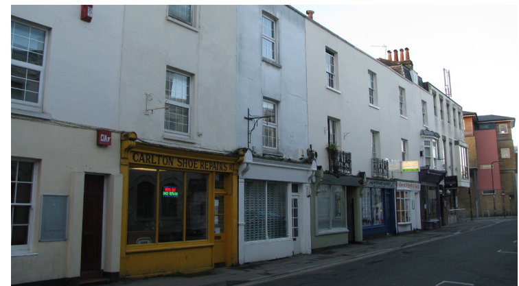
Fig 8 Henstead Road