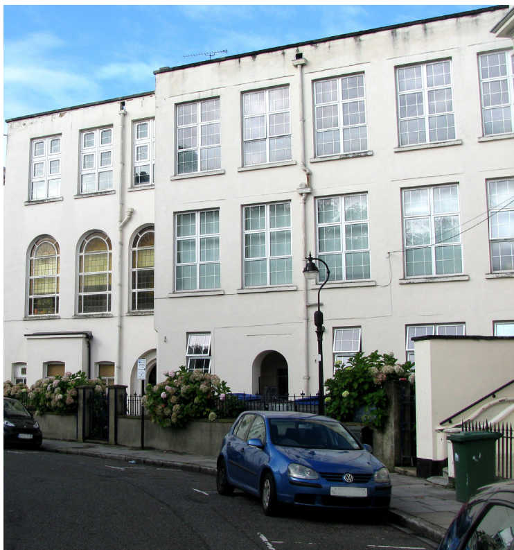
Fig 21 St Anne's Catholic School

The north side of Rockstone Place consists mainly of a series of stuccoed buildings, grouped in threes. These form a continuous terrace occupied by a mix of residential and uses associated with St Anne's School. The south side of Rockstone Place, which forms the northern edge of the Combined Courts Centre, is a garden known as Little Mongers Park. The garden, which was restored in 1991, includes a variety of trees Cherry, Foxglove, Beech, Hornbeam and Amelanchier. The former Director General's House, at the junction with The Avenue, has been altered and extended and now has an office use.