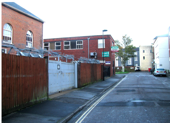
Fig 29 Southampton Street

Bedford Place, Carlton Crescent and Carlton Place are the main streets forming access routes to serve the area. Bedford Place is particularly busy at peak periods and carries a significant amount of through-traffic. Carlton Crescent, which is also a bus route, provides access from London Road. Carlton Place is lightly trafficked and provides access to substantial areas of street parking in Upper and Lower Banister Street as well as businesses in Handford Place and Southampton Street.