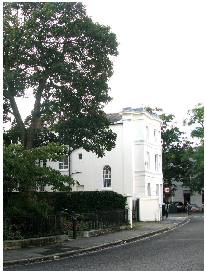
Fig 7 Little Mongers Park