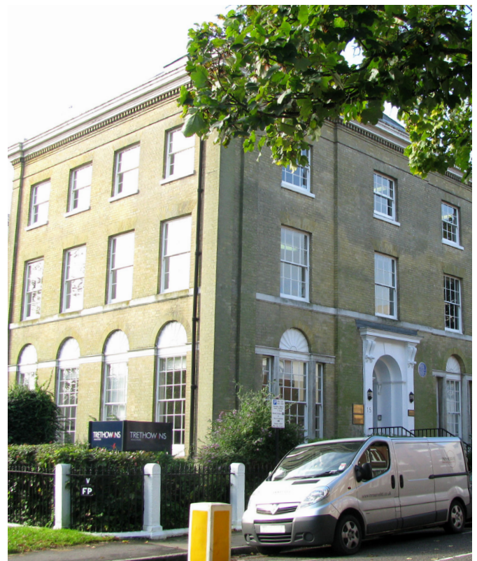
Fig 22 Director General's House