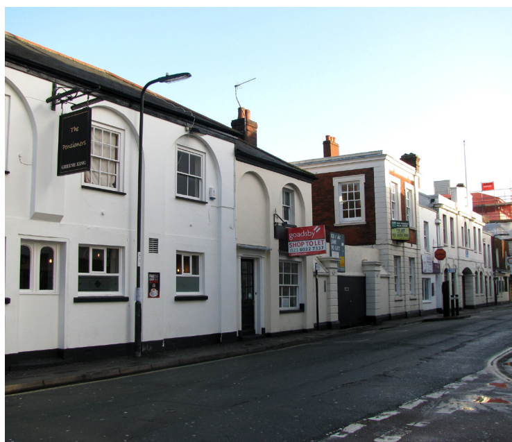
Fig 28 North side of Carlton Place