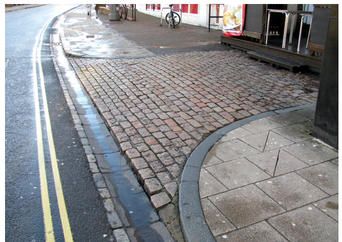
Fig 30 Pavement crossover and black gutter gullies

A good proportion of stone kerb stones remain and in places these sit alongside black gutter gullies. Surviving pavement crossovers are rare, though one exists beside Bedford's public house in Bedford Place. Generally both road and footway surfacing are modern.