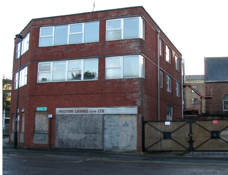
Fig 17. South side of Canton Street Fig 18 Courts complex