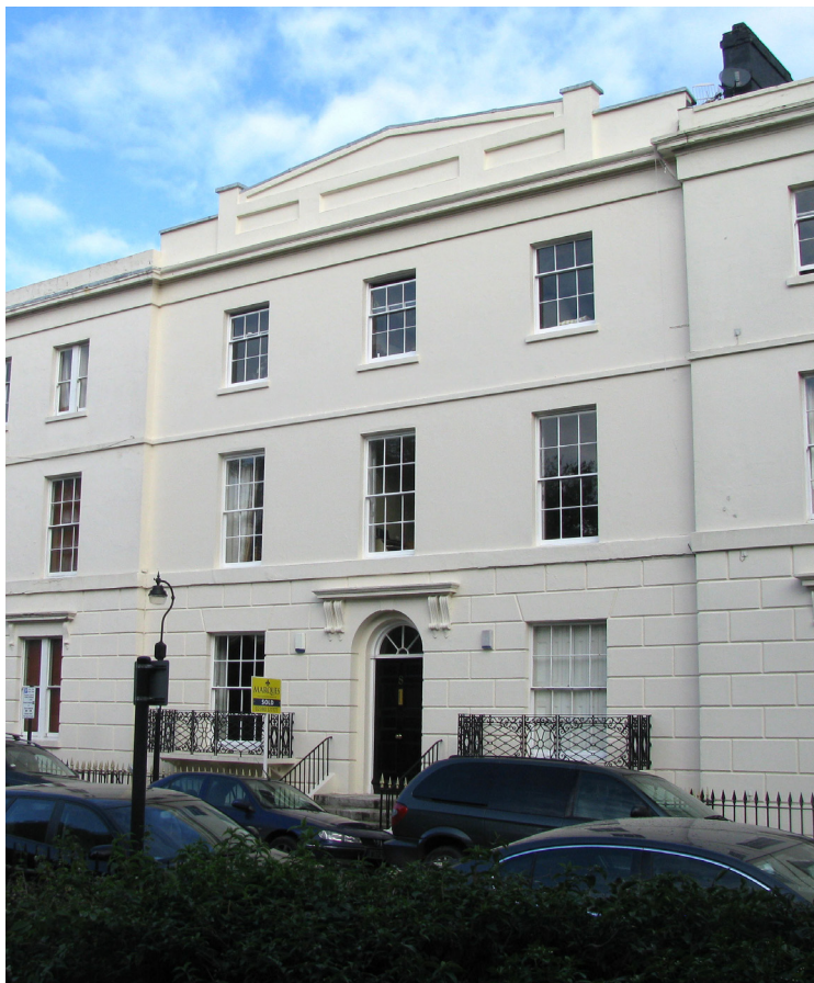
Fig 6 Rockstone Place

The half acre opposite the houses in Rockstone Place and backing on to the already developed Carlton Crescent was left as an amenity for the residents of Rockstone Place and laid out as a small pleasure garden with railings. In 1879 the surviving heirs of Samuel Toomer gifted the garden to Southampton Borough Council to be kept as an open area in perpetuity. 3