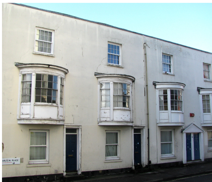
Fig 27 Terrace in Carlton Place

The part of Henstead Road within the Conservation Area is characterised by two and three storey terraced Regency-style town houses. The terrace on the south side is Grade II listed.