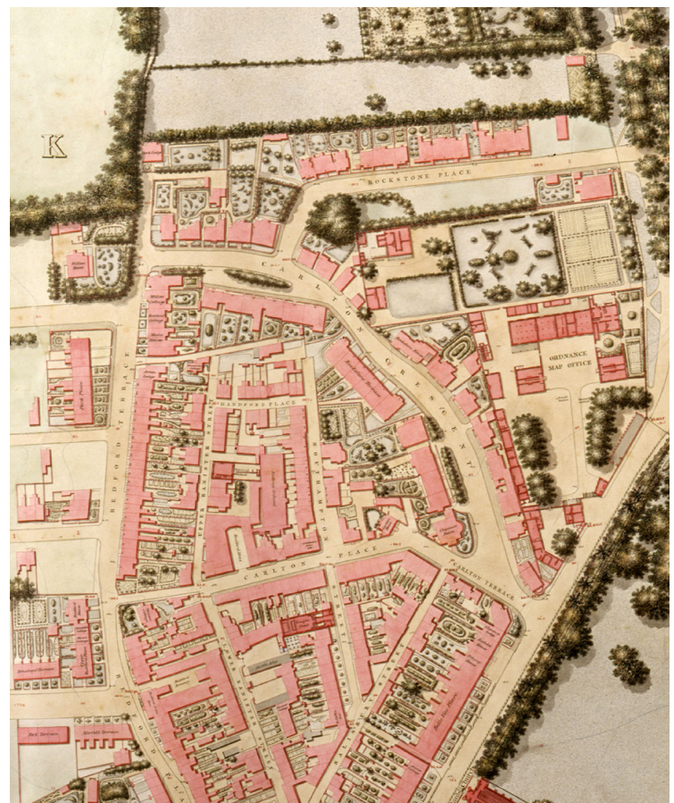
Fig. 3 Where Wilton Road meets Bedford Place